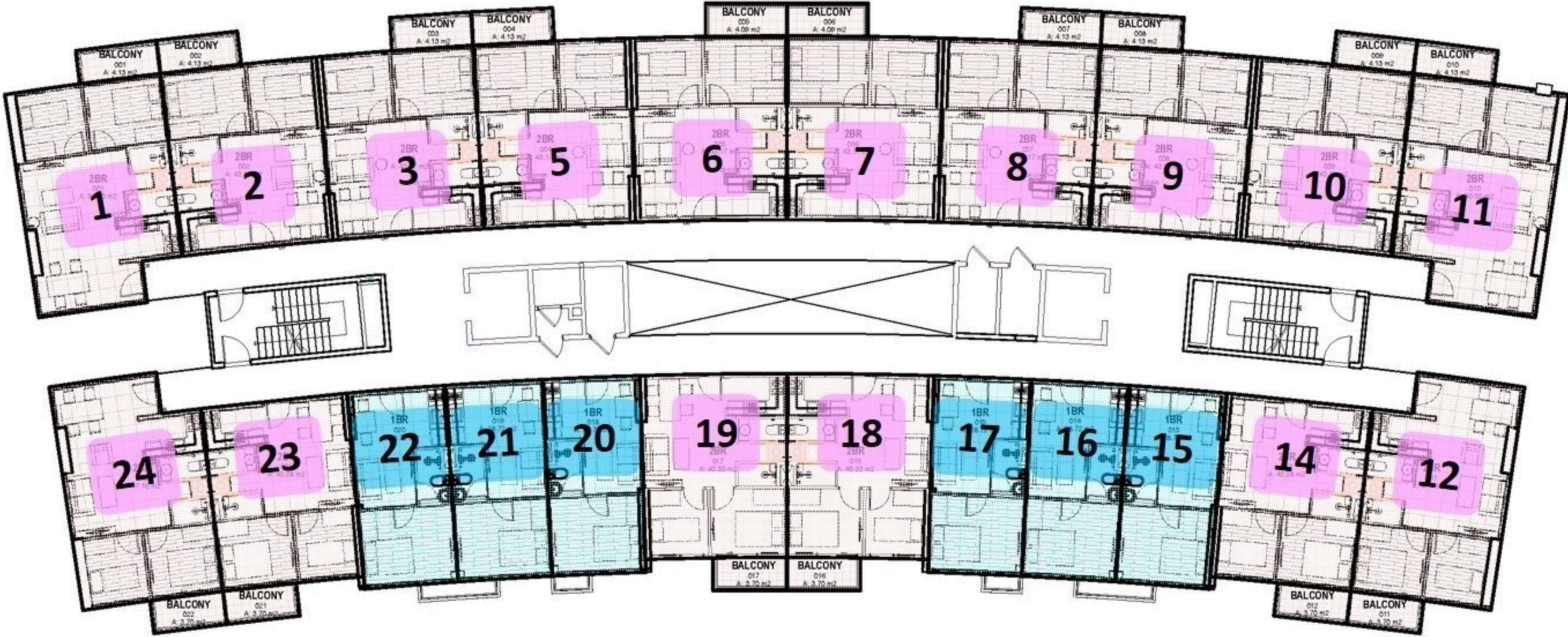
Facing the Central Amenity